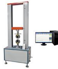
Universal Tensile Testing Machine