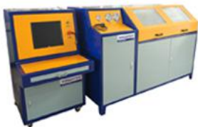
Pipe Hydrostatic Pressure Burst Test Equipment