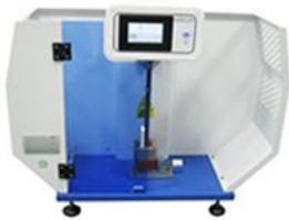
Charpy Izod Pendulum Impact Tester