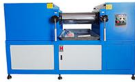
Two Roll Mixing Open Mill