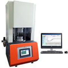
No Rotor Rheometer